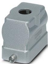
HEAVYCON B10 sleeve housing, for single locking latch, height: 56 mm, with 1 x M20 thread, straight cable outlet

Please be informed that the data shown in this PDF document is generated from our online catalog. Please find the complete data in the user documentation. Our general terms of use for downloads are valid.