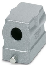
HEAVYCON B10 sleeve housing, for single locking latch, height: 56 mm, with 1 x M20 thread, lateral cable outlet

Please be informed that the data shown in this PDF document is generated from our online catalog. Please find the complete data in the user documentation. Our general terms of use for downloads are valid.