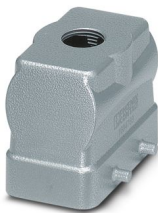
HEAVYCON B10 sleeve housing, for double locking latch, height: 56 mm, with 1 x M20 thread, straight cable outlet

Please be informed that the data shown in this PDF document is generated from our online catalog. Please find the complete data in the user documentation. Our general terms of use for downloads are valid.