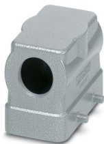
HEAVYCON B10 sleeve housing, for double locking latch, height: 56 mm, with 1 x M20 thread, lateral cable outlet

Please be informed that the data shown in this PDF document is generated from our online catalog. Please find the complete data in the user documentation. Our general terms of use for downloads are valid.