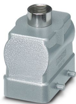
HEAVYCON B10 sleeve housing, for double locking latch, height: 56 mm, with 1 x Pg16 gland, straight cable outlet

Please be informed that the data shown in this PDF document is generated from our online catalog. Please find the complete data in the user documentation. Our general terms of use for downloads are valid.