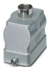
HEAVYCON sleeve housing, for single locking latch, height: 56 mm, with gland, 1 x M20, straight cable outlet

Please be informed that the data shown in this PDF document is generated from our online catalog. Please find the complete data in the user documentation. Our general terms of use for downloads are valid.