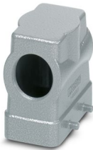
HEAVYCON B10 sleeve housing, for double locking latch, height: 72 mm, with 1 x M25 thread, lateral cable outlet

Please be informed that the data shown in this PDF document is generated from our online catalog. Please find the complete data in the user documentation. Our general terms of use for downloads are valid.