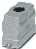
HEAVYCON B16 sleeve housing, for single locking latch, height: 65 mm, with 1 x M32 thread, straight cable outlet

Please be informed that the data shown in this PDF document is generated from our online catalog. Please find the complete data in the user documentation. Our general terms of use for downloads are valid.