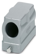
HEAVYCON B16 sleeve housing, for single locking latch, height: 65 mm, with 1 x M25 thread, lateral cable outlet

Please be informed that the data shown in this PDF document is generated from our online catalog. Please find the complete data in the user documentation. Our general terms of use for downloads are valid.