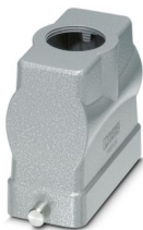
HEAVYCON B16 sleeve housing, for single locking latch, height: 76 mm, with 1 x M32 thread, straight cable outlet

Please be informed that the data shown in this PDF document is generated from our online catalog. Please find the complete data in the user documentation. Our general terms of use for downloads are valid.