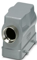
HEAVYCON sleeve housing B16, for double locking latch, height 76 mm, with support 1x M25, lateral conductor exit

Please be informed that the data shown in this PDF document is generated from our online catalog. Please find the complete data in the user documentation. Our general terms of use for downloads are valid.