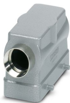
HEAVYCON B16 sleeve housing, for double locking latch, height: 76 mm, with 1 x Pg29 gland, lateral cable outlet

Please be informed that the data shown in this PDF document is generated from our online catalog. Please find the complete data in the user documentation. Our general terms of use for downloads are valid.