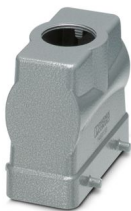
HEAVYCON B16 sleeve housing, for double locking latch, height: 76 mm, with 1 x M40 thread, straight cable outlet

Please be informed that the data shown in this PDF document is generated from our online catalog. Please find the complete data in the user documentation. Our general terms of use for downloads are valid.