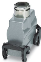
HEAVYCON B16 sleeve housing, with double locking latch, height: 72 mm, with 1 x Pg29 screw connection, straight cable outlet

Please be informed that the data shown in this PDF document is generated from our online catalog. Please find the complete data in the user documentation. Our general terms of use for downloads are valid.