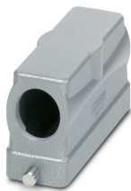
HEAVYCON B24 sleeve housing, for single locking latch, height: 65 mm, with 1 x M25 thread, lateral cable outlet

Please be informed that the data shown in this PDF document is generated from our online catalog. Please find the complete data in the user documentation. Our general terms of use for downloads are valid.