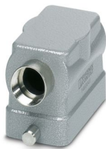
HEAVYCON B6 sleeve housing, for single locking latch, height: 56 mm, with 1 x M25 gland, lateral cable outlet

Please be informed that the data shown in this PDF document is generated from our online catalog. Please find the complete data in the user documentation. Our general terms of use for downloads are valid.