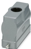
HEAVYCON B24 sleeve housing, for single locking latch, height: 76 mm, with 1 x M32 thread, straight cable outlet

Please be informed that the data shown in this PDF document is generated from our online catalog. Please find the complete data in the user documentation. Our general terms of use for downloads are valid.