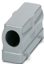
HEAVYCON B24 sleeve housing, for double locking latch, height: 65 mm, with 1 x M25 thread, lateral cable outlet

Please be informed that the data shown in this PDF document is generated from our online catalog. Please find the complete data in the user documentation. Our general terms of use for downloads are valid.