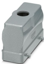
HEAVYCON B24 sleeve housing, for double locking latch, height: 65 mm, with 1 x M32 thread, straight cable outlet

Please be informed that the data shown in this PDF document is generated from our online catalog. Please find the complete data in the user documentation. Our general terms of use for downloads are valid.