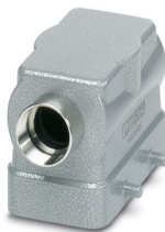
HEAVYCON B10 sleeve housing, for double locking latch, height: 56 mm, with 1 x M20 gland, lateral cable outlet

Please be informed that the data shown in this PDF document is generated from our online catalog. Please find the complete data in the user documentation. Our general terms of use for downloads are valid.