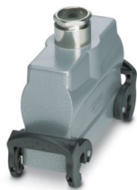
HEAVYCON B24 sleeve housing, with double locking latch, height: 72 mm, with 1 x Pg21 screw connection, straight cable outlet

Please be informed that the data shown in this PDF document is generated from our online catalog. Please find the complete data in the user documentation. Our general terms of use for downloads are valid.