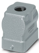
HEAVYCON B6 sleeve housing, for single locking latch, height: 56 mm, with 1 x M25 thread, straight cable outlet

Please be informed that the data shown in this PDF document is generated from our online catalog. Please find the complete data in the user documentation. Our general terms of use for downloads are valid.