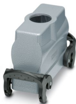
HEAVYCON B24 sleeve housing, with double locking latch, height: 72 mm, with 1 x M32 thread, straight cable outlet

Please be informed that the data shown in this PDF document is generated from our online catalog. Please find the complete data in the user documentation. Our general terms of use for downloads are valid.