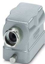
Sleeve housing, for single locking latch, height: 56 mm, with screw connection, 1 x M20, lateral cable outlet

Please be informed that the data shown in this PDF document is generated from our online catalog. Please find the complete data in the user documentation. Our general terms of use for downloads are valid.