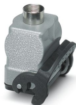
HEAVYCON B6 coupling housing, with single locking latch, height: 77.5 mm, with 1 x Pg21 gland, straight cable outlet

Please be informed that the data shown in this PDF document is generated from our online catalog. Please find the complete data in the user documentation. Our general terms of use for downloads are valid.