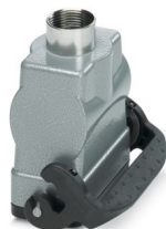
HEAVYCON B10 coupling housing, with single locking latch, height: 77.5 mm, with 1 x Pg29 gland, straight cable outlet

Please be informed that the data shown in this PDF document is generated from our online catalog. Please find the complete data in the user documentation. Our general terms of use for downloads are valid.