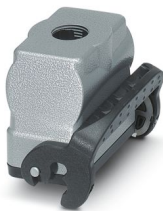
HEAVYCON B10 coupling housing, with single locking latch, height: 77.5 mm, with 1 x M25 thread, straight cable outlet

Please be informed that the data shown in this PDF document is generated from our online catalog. Please find the complete data in the user documentation. Our general terms of use for downloads are valid.