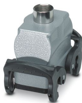
HEAVYCON B10 coupling housing, with double locking latch, height: 77.5 mm, with 1 x Pg21 gland, straight cable outlet

Please be informed that the data shown in this PDF document is generated from our online catalog. Please find the complete data in the user documentation. Our general terms of use for downloads are valid.