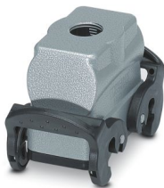
HEAVYCON B10 coupling housing, with double locking latch, height: 77.5 mm, with 1 x M25 thread, straight cable outlet

Please be informed that the data shown in this PDF document is generated from our online catalog. Please find the complete data in the user documentation. Our general terms of use for downloads are valid.