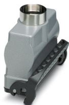
HEAVYCON B24 coupling housing, with single locking latch, height: 80.5 mm, with 1 x M32 gland, straight cable outlet

Please be informed that the data shown in this PDF document is generated from our online catalog. Please find the complete data in the user documentation. Our general terms of use for downloads are valid.