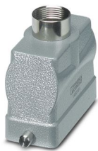
HEAVYCON B24 sleeve housing, for single locking latch, height: 76 mm, with 1 x Pg21 gland, straight cable outlet

Please be informed that the data shown in this PDF document is generated from our online catalog. Please find the complete data in the user documentation. Our general terms of use for downloads are valid.