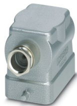
HEAVYCON B6 sleeve housing, for single locking latch, height: 56 mm, with 1 x M20 screw connection, lateral cable outlet

Please be informed that the data shown in this PDF document is generated from our online catalog. Please find the complete data in the user documentation. Our general terms of use for downloads are valid.