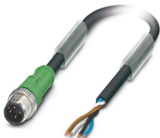
Sensor/actuator cable, 4-position, PUR, black-gray RAL 7021, Plug straight M12, coding: A, on free cable end, cable length: 2 m

Please be informed that the data shown in this PDF document is generated from our online catalog. Please find the complete data in the user documentation. Our general terms of use for downloads are valid.