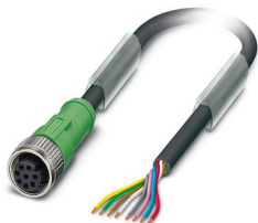
Sensor/actuator cable, 8-position, PUR halogen-free, black-gray RAL 7021, free cable end, on Socket straight M12, coding: A, cable length: 10 m

Please be informed that the data shown in this PDF document is generated from our online catalog. Please find the complete data in the user documentation. Our general terms of use for downloads are valid.