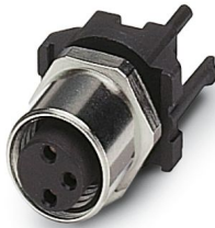
Device connector rear mounting, 3-position, Socket, straight, M8, coding: A, Rear mounting, M8 x 1, Wave soldering

Please be informed that the data shown in this PDF document is generated from our online catalog. Please find the complete data in the user documentation. Our general terms of use for downloads are valid.