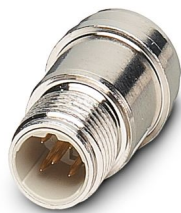
Device connector rear mounting, 5-position, Pin, straight, M12, coding: B, Rear mounting, Solder pins

Please be informed that the data shown in this PDF document is generated from our online catalog. Please find the complete data in the user documentation. Our general terms of use for downloads are valid.