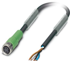
Sensor/actuator cable, 4-position, PUR halogen-free, black-gray RAL 7021, free cable end, on Socket straight M8, coding: A, cable length: 15 m

Please be informed that the data shown in this PDF document is generated from our online catalog. Please find the complete data in the user documentation. Our general terms of use for downloads are valid.