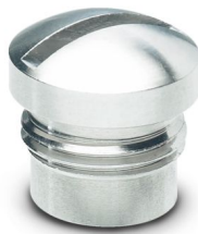
M12 high-grade steel screw plug, for unoccupied M12 sockets of the sensor/actuator cables, boxes and flush-type connectors for the food industry

Please be informed that the data shown in this PDF document is generated from our online catalog. Please find the complete data in the user documentation. Our general terms of use for downloads are valid.