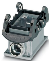
Box mounting base, with double locking latch, height 52 mm, with screw connection, 2x M20

Please be informed that the data shown in this PDF document is generated from our online catalog. Please find the complete data in the user documentation. Our general terms of use for downloads are valid.