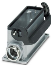
Box mounting base, with single locking latch, height 67 mm, with screw connection, 1x M25

Please be informed that the data shown in this PDF document is generated from our online catalog. Please find the complete data in the user documentation. Our general terms of use for downloads are valid.