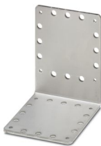
DUPLICON, mounting bracket, made of 3 mm high-grade steel plate, with predrilled holes

Please be informed that the data shown in this PDF document is generated from our online catalog. Please find the complete data in the user documentation. Our general terms of use for downloads are valid.