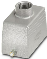
HEAVYCON sleeve housing B6, for single locking latch, height 40 mm, with support 1x M20, straight conductor exit

Please be informed that the data shown in this PDF document is generated from our online catalog. Please find the complete data in the user documentation. Our general terms of use for downloads are valid.