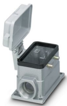
HEAVYCON box mounting base B10, with double locking latch, height 52 mm, with supports 2xM25, with protective cover

Please be informed that the data shown in this PDF document is generated from our online catalog. Please find the complete data in the user documentation. Our general terms of use for downloads are valid.