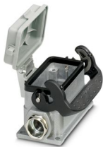
HEAVYCON box mounting base B10, with double locking latch, height 52 mm, with supports 2xM20 and protective cover

Please be informed that the data shown in this PDF document is generated from our online catalog. Please find the complete data in the user documentation. Our general terms of use for downloads are valid.