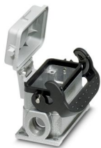
HEAVYCON box mounting base B10, with double locking latch, height 52 mm, with supports 2xM25 and protective cover

Please be informed that the data shown in this PDF document is generated from our online catalog. Please find the complete data in the user documentation. Our general terms of use for downloads are valid.