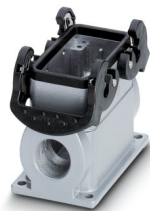
HEAVYCON box mounting base B10, with double locking latch, height 52 mm, with supports 2xM25

Please be informed that the data shown in this PDF document is generated from our online catalog. Please find the complete data in the user documentation. Our general terms of use for downloads are valid.