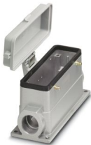
HEAVYCON box mounting base B16, for double locking latch, height 67 mm, with supports 2x M25, with cover

Please be informed that the data shown in this PDF document is generated from our online catalog. Please find the complete data in the user documentation. Our general terms of use for downloads are valid.