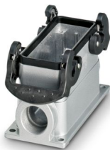
HEAVYCON box mounting base B16, with double locking latch, height 67 mm, with support 1xM32

Please be informed that the data shown in this PDF document is generated from our online catalog. Please find the complete data in the user documentation. Our general terms of use for downloads are valid.