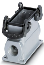
HEAVYCON box mounting base B16, with double locking latch, height 84 mm, with support 1xM25

Please be informed that the data shown in this PDF document is generated from our online catalog. Please find the complete data in the user documentation. Our general terms of use for downloads are valid.