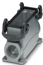
HEAVYCON box mounting base B24, with double locking latch, height 84 mm, with support 1xM32

Please be informed that the data shown in this PDF document is generated from our online catalog. Please find the complete data in the user documentation. Our general terms of use for downloads are valid.